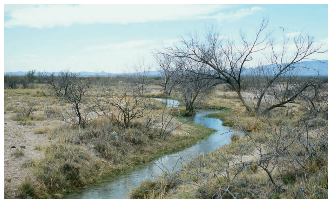
Fig. 7. Habitat: Outlet of Balneario San Diego de Alcalá, type locality of G. zarskei.

well in the range of what has been reported for species of the genera Xiphophorus (MEYER & SCHARTL, 2002, MEYER & SCHARTL, 2003), Poecilia (MEYER, SCHNEI-DER, RADDA, WILDE & SCHARTL, 2004) and Priapella (SCHARTL, MEYER & WILDE, 2006).