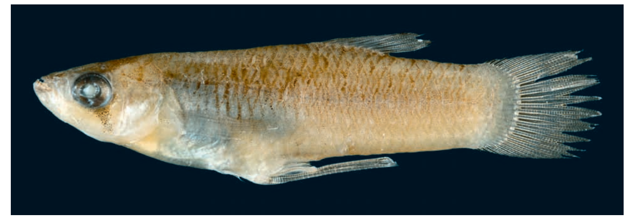
Fig. 1. Gambusia zarskei; Mexico: Balneario San Diego de Alcalá, holotype, MTD F 31802, male, 23.1 mm SL.