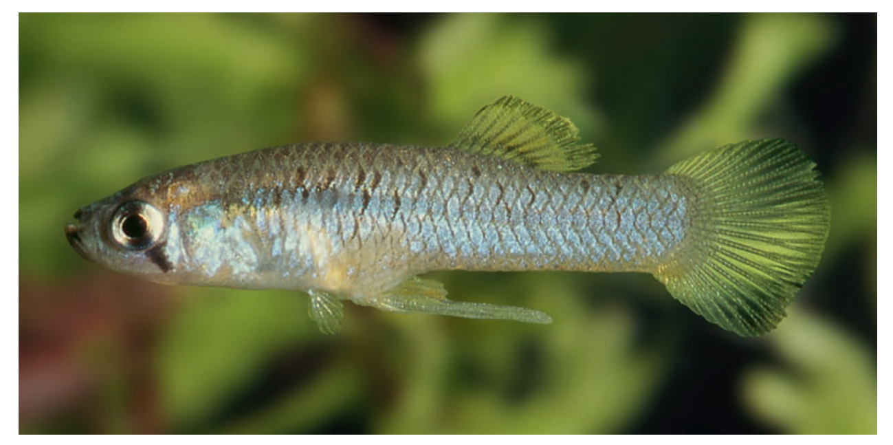
Fig. 4. Gambusia zarskei; Mexico: Balneario San Diego de Alcalá, male.