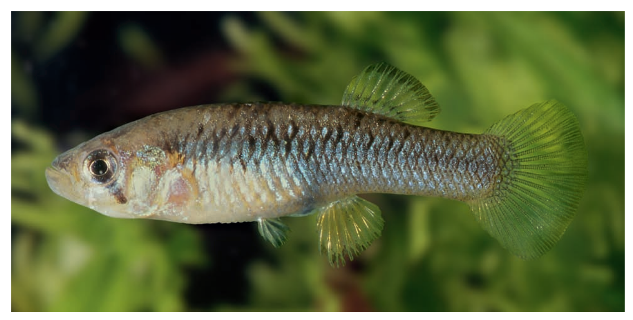
Fig. 5. Gambusia zarskei; Mexico: Balneario San Diego de Alcalá, female.

developed spine series; distal spines of ray 3 very long, angular and projected beyond rays 4 to 5, 6 to 7 angulate spines long and pointed anterodistally, base of ray 3 somewhat tapered; ray 4a very short reaching to the middle of the large rounded terminal hook on ray 5a, ray 4a with an anterior swelling (elbow), elbow segments usually not fused, major elbow segment straight and not very long; ray 4p longer than 4a and terminating with a large rounded hook, 5 to 8 retrorse serrae, the lengths much longer than the widths of their bases; ray 5a shorter than ray 4p and longer than ray 4a. Ray 6 and 7 straight, ray 6 thickened distally.