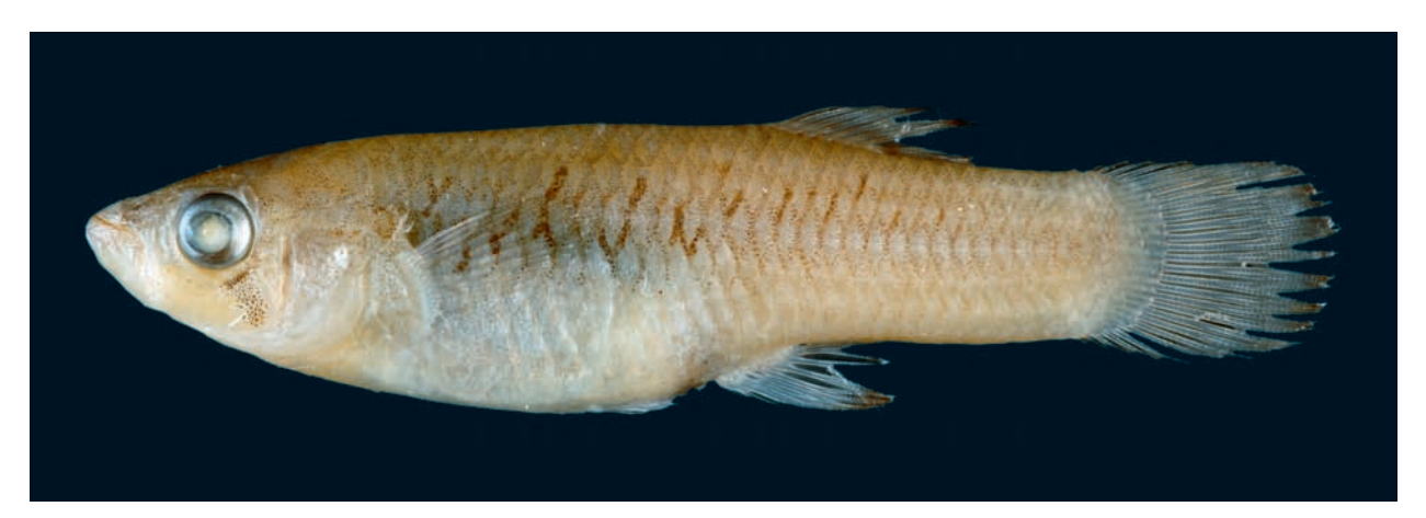
Fig. 2. Gambusia zarskei; Mexico: Balneario San Diego de Alcalá, paratype, MTD F 31803, female, 28.6 mm SL.