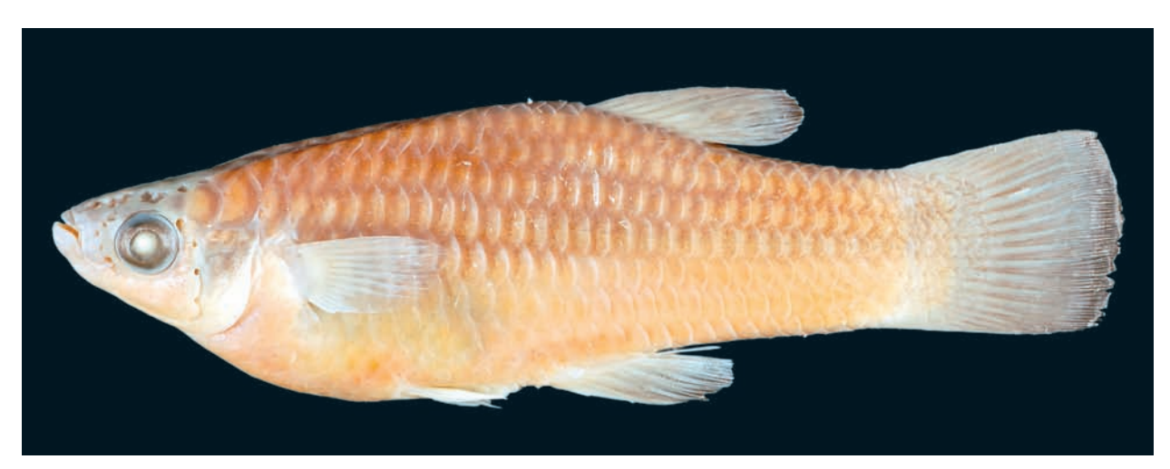
Fig. 2. Priapella lacandonae; Mexico: río Mizola 20 km S Palenque, paratype, MTD F 32299, female, 49.1 mm SL.