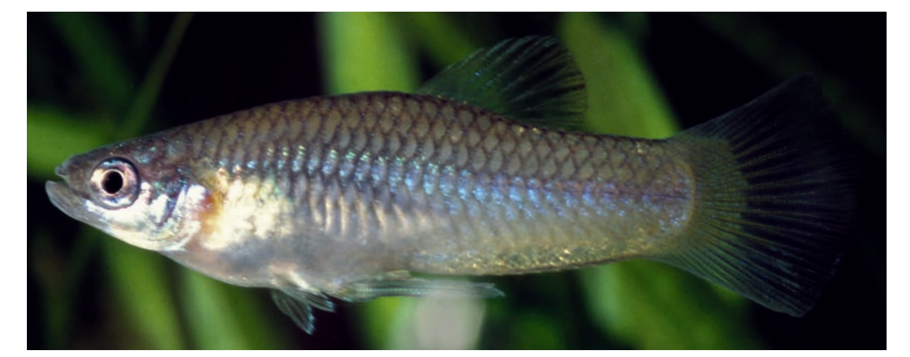
Fig. 3. Priapella lacandonae; Mexico: Cascada Misol-Ha, aquarium specimen, male.