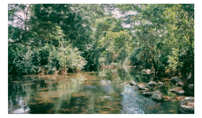
Fig. 5. Habitat: rio Mizola, above Cascada Misol-Ha, type locality of P. lacandonae .

distance values between P. lacandonae and the most closely related species, P. compressa and P. chamu lae are even higher than corresponding values for the well recognized species of Southern swordtails. The genetic distance between one individual of P. lacan donae collected above the waterfall and one below the waterfall was zero.