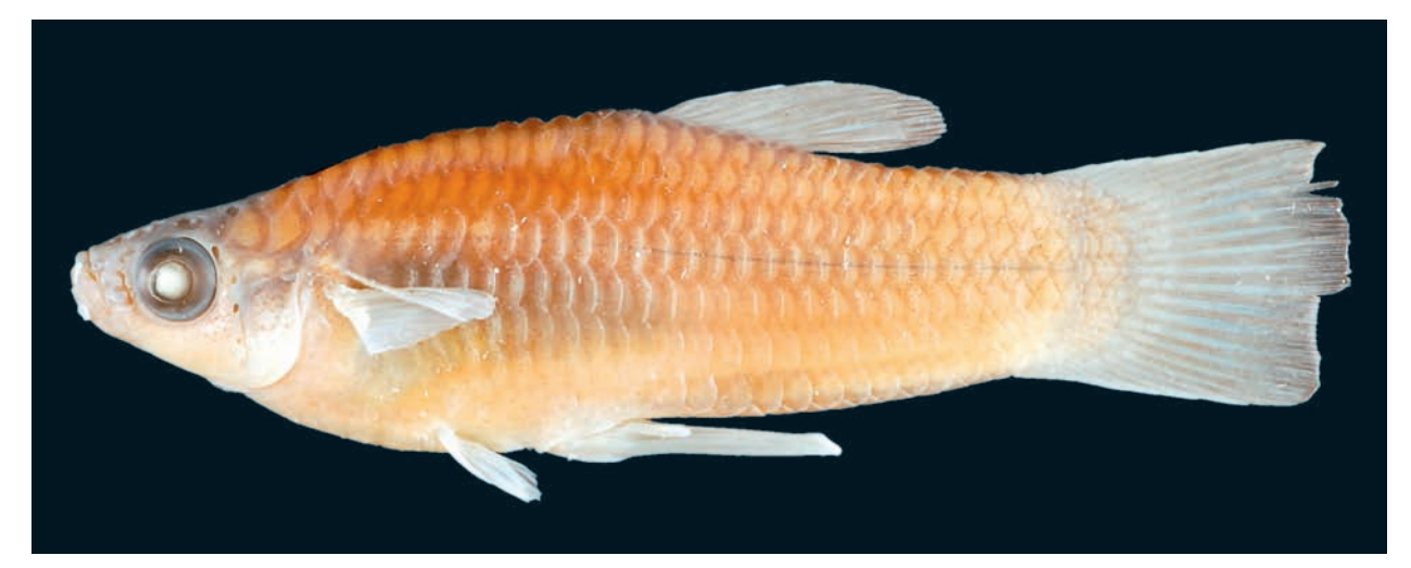
Fig. 1. Priapella lacandonae; Mexico: río Mizola 20 km S Palenque, holotype, MTD F 32298, male, 32.6 mm SL.