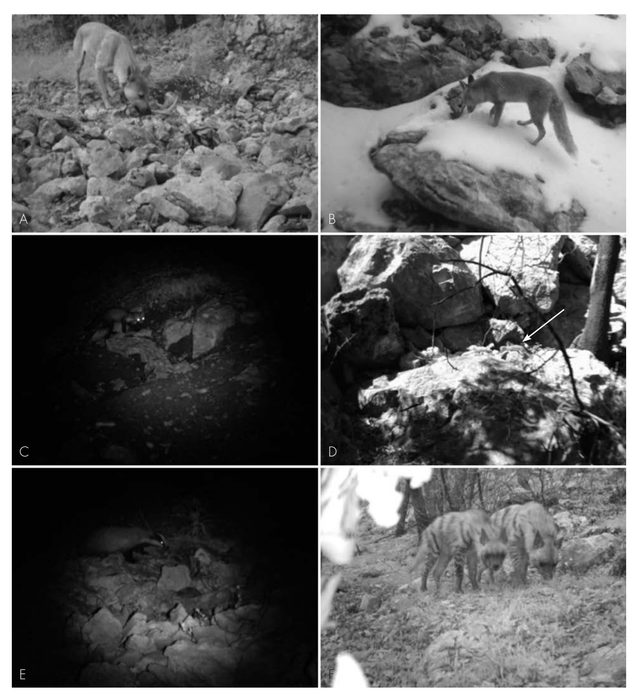
Fig. 2. A. The Wolf, Canis lupus . B. The Red Fox, Vulpus vulpus . C. The Stone Martin, Martes foina . D. Least Weasel, Mustela nivalis . E. The European Badger, Meles meles . F. A couple of striped hyenas caught by the camera before sunset in JMBR. Least weasel is very difficult to spot in print. [This is the best photo that the weasel could be clearly seen since it was only photo trapped 3 times.]

(Table 1). The Least Weasel, Mustela nivalis and the European Badger, Meles meles , were least photographed, 0.07% and 0.05% of all photos respectively (Fig. 2D and 2E). Both species showed activity during spring and summer, with virtually no signs in fall and winter.