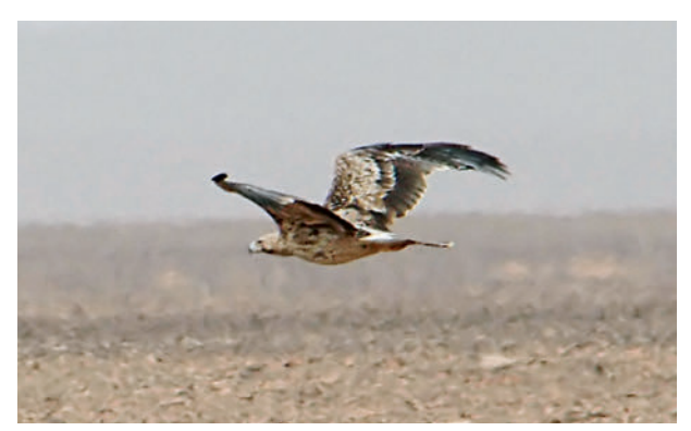
Fig. 4. Immature Imperial Eagle in Hammada/steppe habitat.

not sampled and analyzed, but noted when accompanied by eagle pellets to minimize confusion with other predators feeding remains.