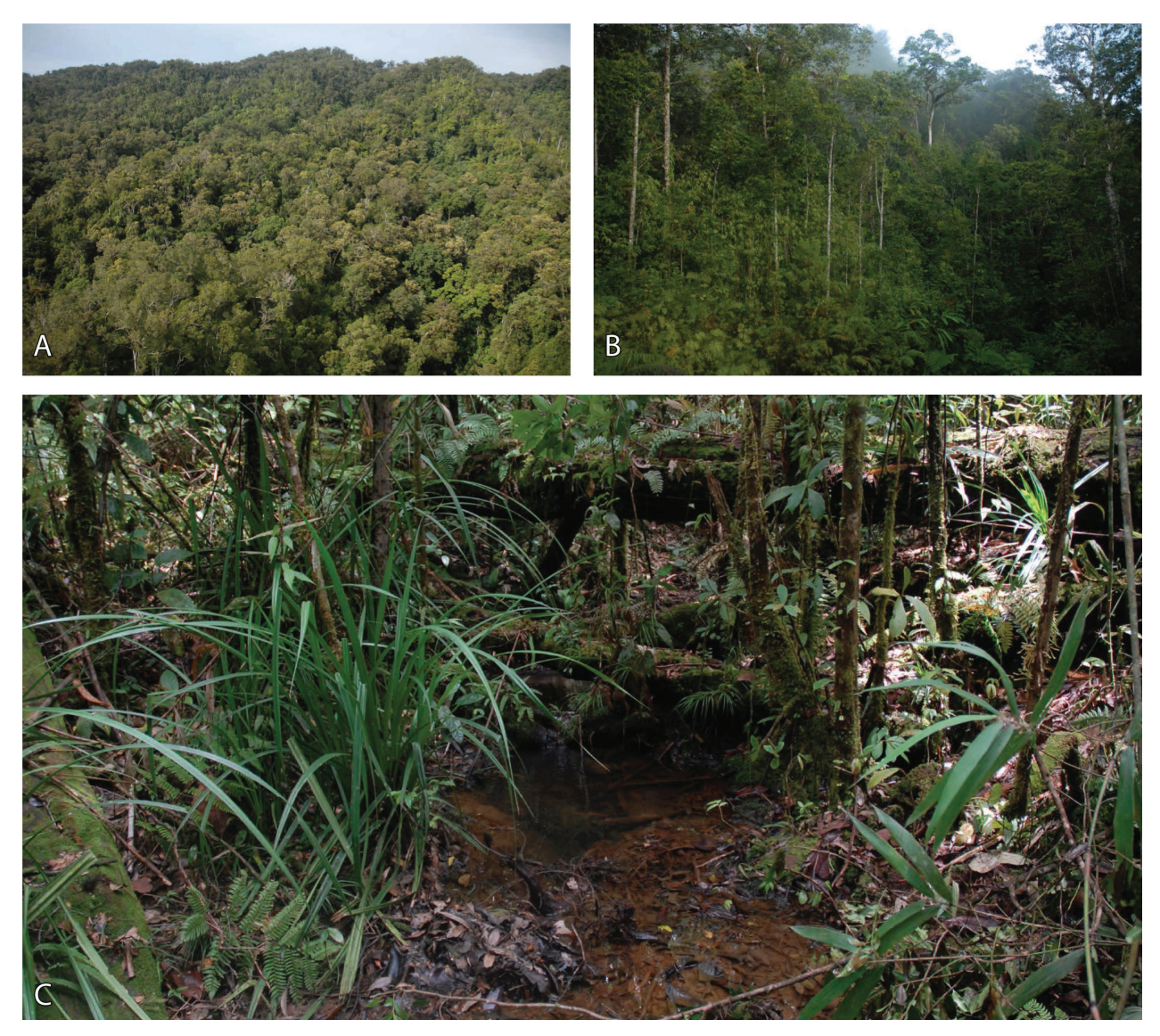
Figure 6. Habitat at type locality of Litoria insularis sp. nov. in the Nakanai Mountains, East New Britain Province, Papua New Guinea. A Aerial view of upper hill forest on rugged karst; B forest profile; C slow-flowing stream along which the type series was collected.

and from L. lododesma Menzies, Richards & Tyler, 2008 by its much larger size (max male SVL 41.2 mm versus 23.8 mm), dorsum brown or grey with scattered brown flecks (versus typically green without pattern), and the absence of white lateral stripe on the head (versus usually present).