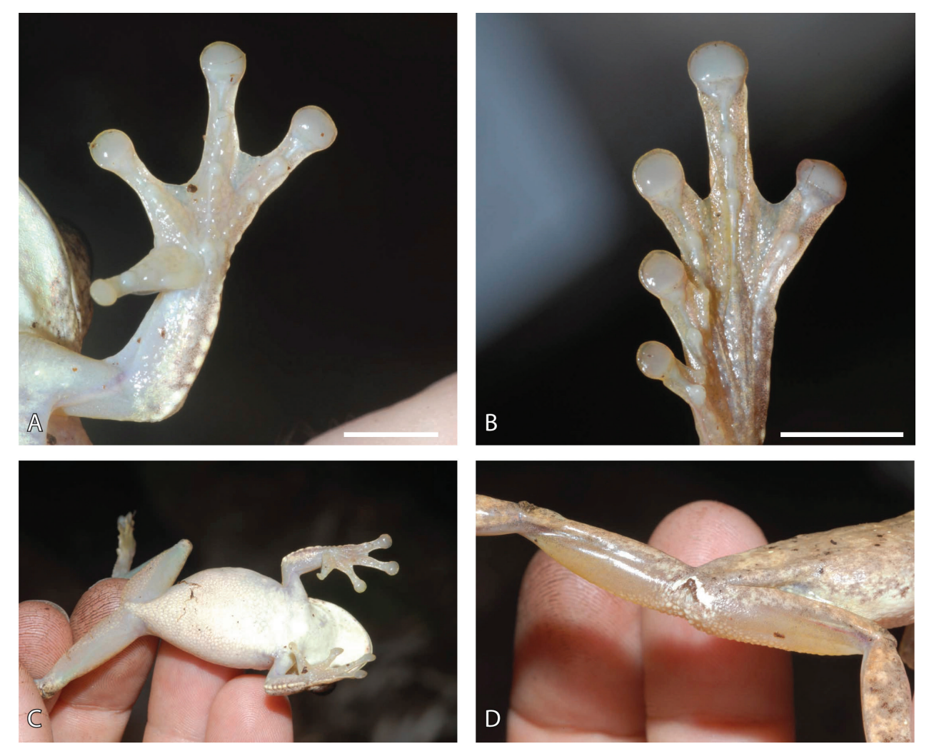
Figure 2. Details of holotype of Litoria insularis sp. nov. SAMA R64781. A Ventral view of fingers and webbing; B ventral view of toes and webbing (scale bars = 5 mm); C ventral colouration; D hidden colouration of thighs.

Description of holotype. Habitus moderately robust (Fig. 1A-B), limbs moderately long (TL/SVL 0.53); snout narrowly rounded in dorsal aspect, distinctly sloping in lateral aspect. Canthus poorly defined, broadly rounded, slightly curved in dorsal view; loreal region sloping, slightly concave; nostrils near tip of snout, oriented laterally. Eyes large (EYE/SVL 0.127). Tongue broadly oval with distinct posterior notch; vocal slits short, extending anteriorly from level of angle of jaw. Vomero-palatine ridges located midway between internal nares, prominently raised, about 0.6 mm apart, each with 3-4 distinct teeth. Tympanum moderately large (TYM/SVL 0.070), annulus distinct except for postero-dorsal edge obscured by thick, curved, postocular fold extending from posterior edge of eye to above axillary junction. Skin finely but distinctly granular dorsally; abdomen coarsely granular; throat and chest coarsely ridged.