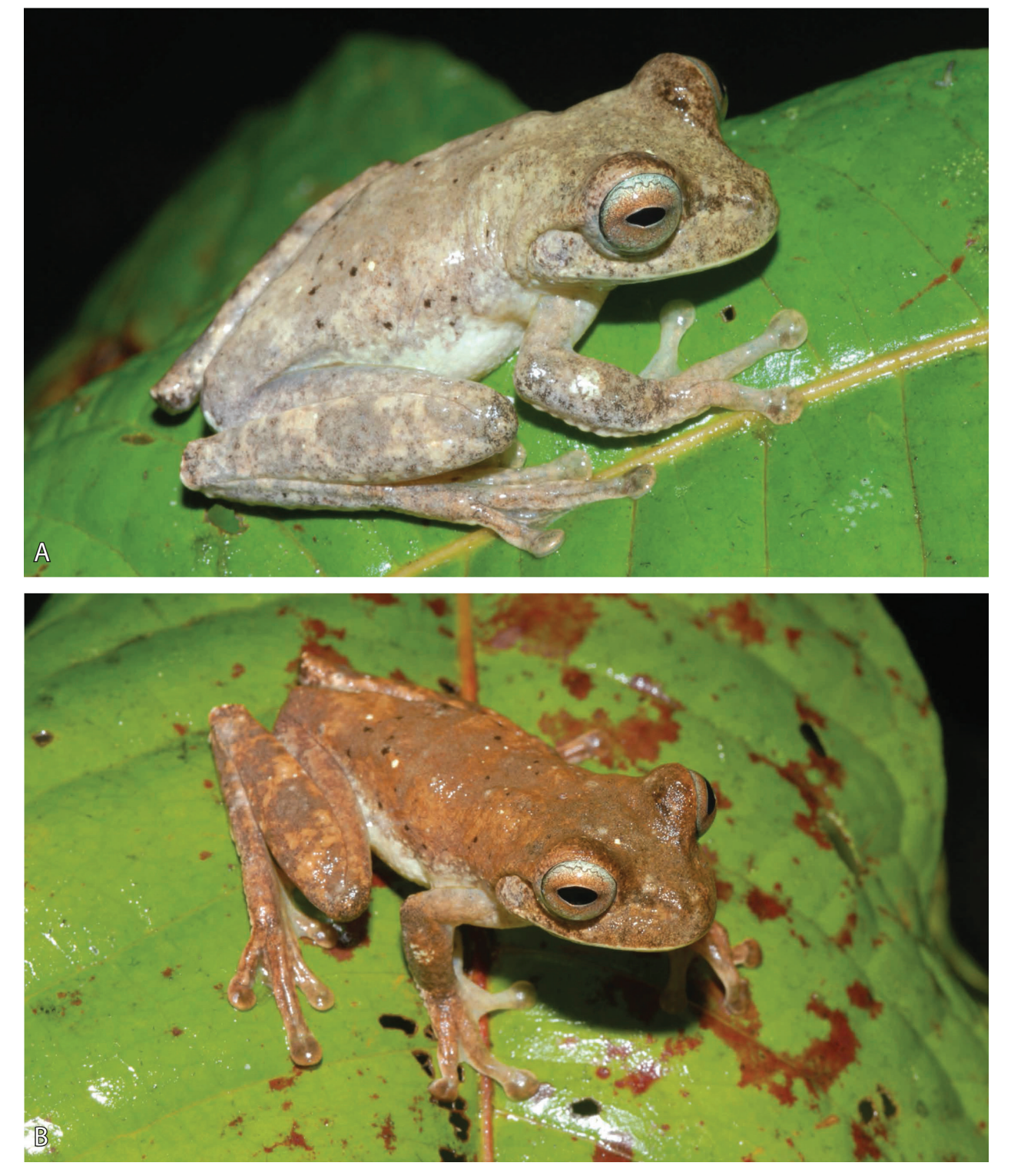
Figure 1. Litoria insularis sp. nov. holotype SAMA R64781 from the Nakanai Mountains, East New Britain, Papua New Guinea in life. Images A and B show temporal variation in dorsal colouration, but consistent pattern of mottling and dark-brown flecks.

41.7 mm); finger webbing moderate, not extending beyond base of second phalanx on any fingers; toe webbing moderate, extending to base of second phalanx on both sides of toe 4; finger discs moderately expanded (3FD/ SVL 0.059–0.062); toe discs moderately expanded (4TD/ SVL 0.052–0.058); bones of limbs green in life; lower forelimbs and hindlimbs with low crenulated dermal ridges along lateral edges; male throat and neck smooth