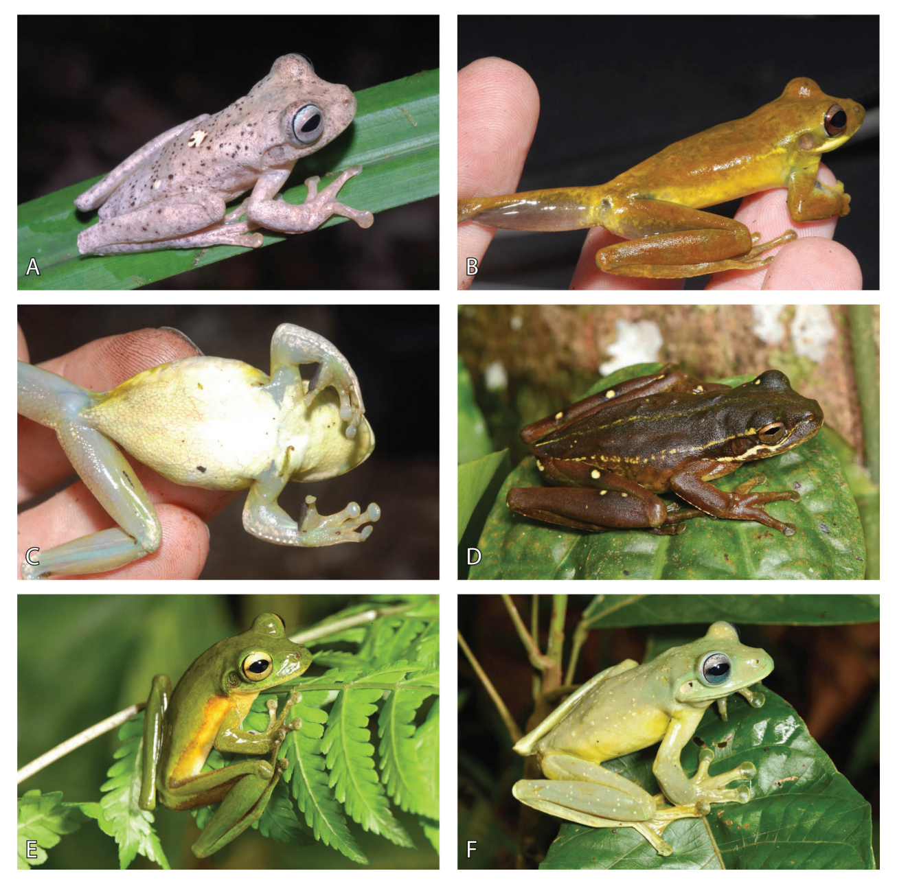
Figure 3. Details of species in the Litoria thesaurensis Group in life. A Litoria insularis sp. nov. paratype SAMA R66896 in life; B Litoria thesaurensis SAMA R64668 from New Britain showing yellow lateral pigmentation; C ventral view of L. thesaurensis from New Britain, with round tubercles on the throat faintly visible; D L. thesaurensis from Bougainville showing dark brown weakly striped pattern; E Litoria thesaurensis from Bougainville showing plain green dorsum; F Litoria lutea from Bougainville showing light green dorsum colouration with off-white flecks. All photographs by S.J. Richards.

als. Exposed surfaces of limbs and digits same colouration as torso but with more obvious and intricate mottling, denser brown stippling and lacking dark-brown flecks. Lateral and ventral surfaces of torso, throat and limbs unpatterned, largely off-white with small areas of near translucent skin, especially on thighs and upper arms (Fig. 2C–D). Iris patterned with dense light-brown stippling and a prominent light-blue outer ring.